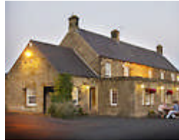
The Ridley Arms, Stannington, Nr. Morpeth, NE61 6EL