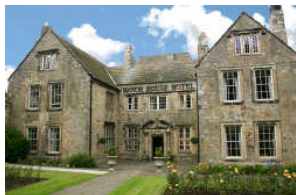
The Manor House, Front Street, West Auckland, DL14 9HW